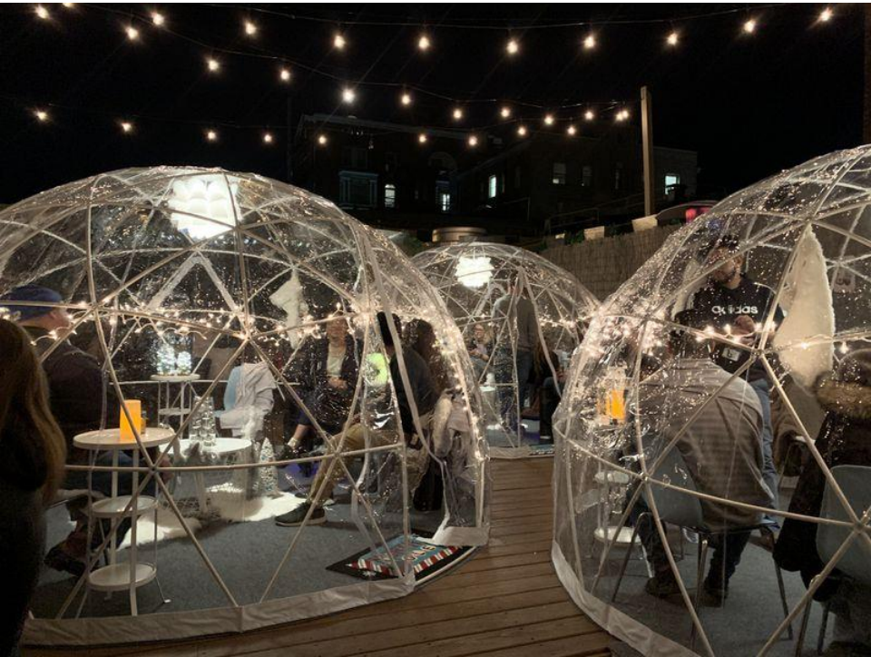
Elm City Social rooftop, Hartford, Ct.