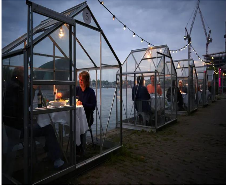
Amsterdam, ETEN restaurant