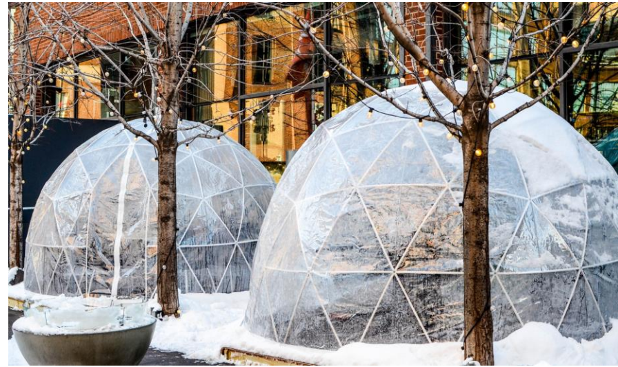
Winter Domes at the Freehouse in Minneapolis